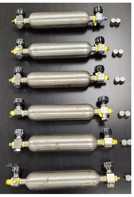
Figure 3. NGL samples are provided in sampling cylinders. A few grams of sample is mixed with an equal mass 10-mM HCl (aq) for extraction.

OndaVia offers ppm-level analysis kits for MEA-triazine (OV-OP-BOIO-PPM), dithiazine (OV-OP-BOII-PPM) and monoethanolamine (OV-OP-BO03). These kits offer 10% accuracy over 5- to 100-ppm with a test that requires under two minute to perform. The user mixes the sample with our proprietary reagent, adds this mixture to a vial of nanoparticles, and then analyzes the nanoparticle-sample mixture in a portable Raman spectrometer.