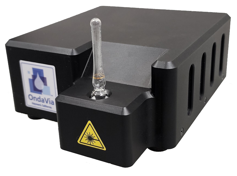
result is a few-minute test with portable instrumentation Figure 1. OPAL-103 OndaVia Portable Analysis Laboratory.

Quantitative Raman Spectroscopy is a set of proprietary tools that enable fast, easy chemical measurement using an all-optical technique. OndaVia has developed a large suite of analysis methods applicable to the oil & gas industry. Based on customer requests, we have developed a test method for monoethanolamine (MEA) and dithiazine in natural gas liquids and slop water samples. For hydrocarbon analysis, this method requires an extraction step into aqueous solution, followed by analysis via our standard amine part-per-million analysis methods. The